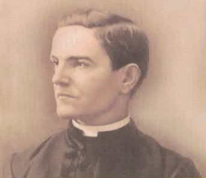
THE VENERABLE MICHAEL MCGIVNEY, FOUNDER, KNIGHTS OF COLUMBUS

The Venerable Michael McGivney founded the Knights of Columbus in 1882 at St. Mary's in New Haven, CT as an organization committed to Unity as a Catholic lay organization, Charity to those in need, and Fraternity with fellow brother Knights.